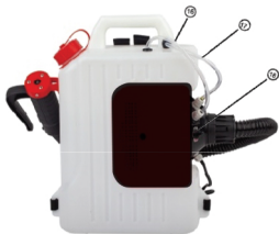
DFG-1000 (10 Liter)